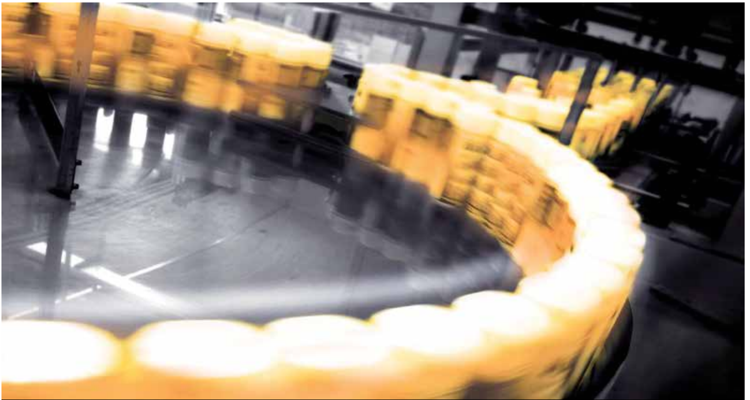
ABB JOKAB SAFETY Products