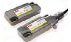
Ex safety switches