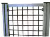
Quick Guard fencing