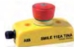
Field emergency stops