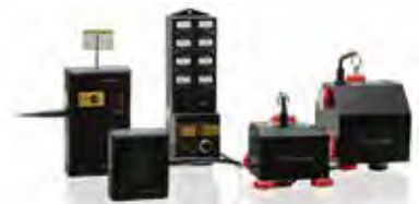
Stop time analyzers