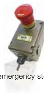
Ex emergency stops