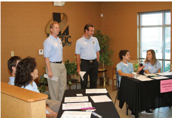
Logic Team Members Help with the Open House.